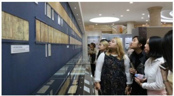
Exhibition alive with visitors from around the world

n September 21, 2016, "The Lotus Sutra—A Message of Peace and Harmonious Coexistence" exhibition was launched in South Korea. Counting this, the exhibition had shown in 13 countries and territories.