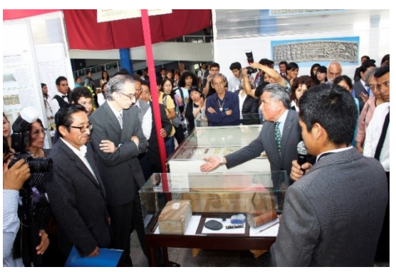
Peru exhibition after Brazil and Argentina in Latin America

In the exhibition held till November 26, visitors counted approximately 1,300.