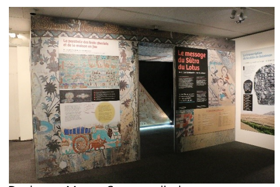
Dunhuang Magao Caves on display

It also featured 26 original manuscripts from IOM RAS, including the Gandhari manuscript of the Dhamapada from the 1st and 2nd centuries, and the Sogdian manuscript of the Suka-sutra from the 7th and 8th centuries.