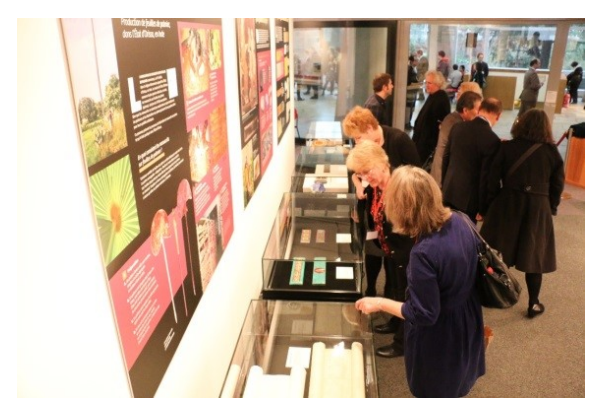
Keen visitors on details

The following are the comments shared by some quests: