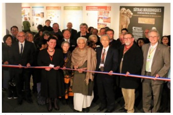
Grand opening with recognized guests

The Sanskrit Lotus Sutra Manuscript from IOM RAS, which is also known as the Petrovsky manuscript, recognized as one of the 'diamonds' of the world's largest and most valuable Russian collections, was also on display. It first appeared at the exhibition "Lotus Sutra and Its World: Buddhist Manuscripts of the Great Silk Road" held by the IOP in 1998. The manuscript is assumed to have been written in 8th century.