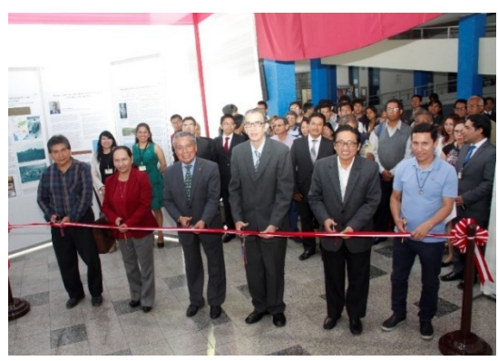
Ribbon-cutting ceremony by heads of the UNMSM

On November 21, 2016, "The Lotus Sutra—A Message of Peace and Harmonious Coexistence" exhibition was launched at the Universidad Nacional Mayor de San Marcos (UNMSM) in Lima. Peru became the fourteenth for the exhibition in countries and territories of the world. UNMSM, established in 1551, is the oldest academic institution in South America. The exhibition was planned and produced by the Institute of Oriental Philosophy (IOP) and organized by Peru Soka Gakkai International (SGI).